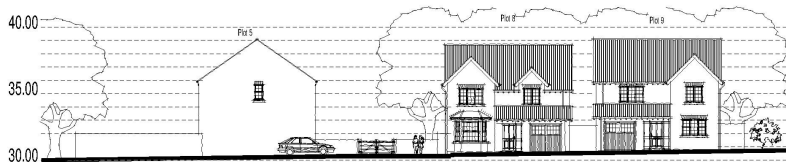
Streetscape Elevation 4 - Looking Towards Plots 8 & 9

THIS COPY HAS BEEN MADE BY OR WITH THE AUTHORITY OF RYedale DISTRICT COUNCIL PURSUANT TO SECTION 41 OF THE COPYRIGHT ACT 1988 AND SHOULD NOT BE REPRODUCED OR TRANSMITTED IN ANY FORM OR BY ANY MEANS, ELECTRONIC OR MECHANICAL, INCLUDING PHOTOCOPYING, RECORDING, OR BY ANY INFORMATION STORAGE AND RETRIEVAL SYSTEM, WITHOUT THE WRITTEN PERMISSION OF THE COPYRIGHT OWNER.