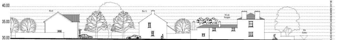
Streetscape Elevation 3 - Looking Across New Site Towards Plots 8 - 10 & 56 Low Moorgate