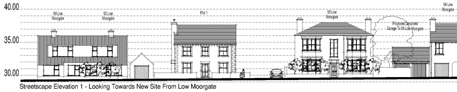
Streetscape Elevation 1 - Looking Towards New Site From Low Moorgate